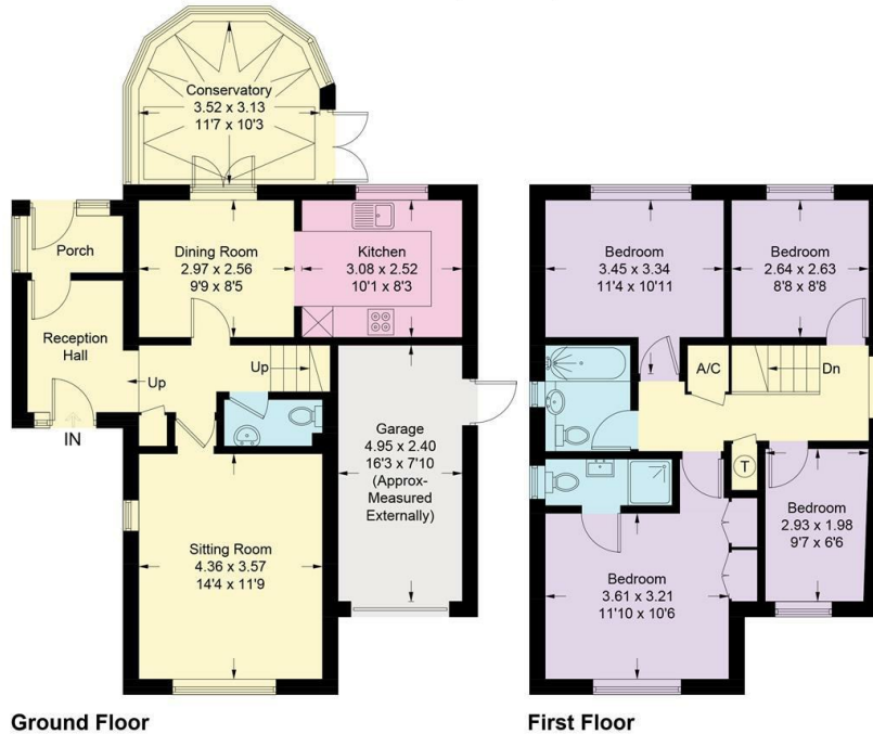
Illustration for identification purposes only, measurements are approximate, not to scale. Fourlabs.co © (ID1284917)